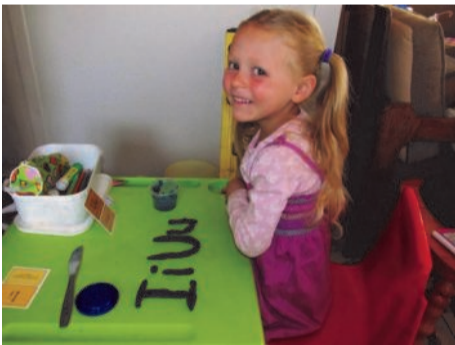
Left: I love kindergarten!